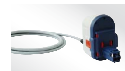
Power supply 150 V / 230 V