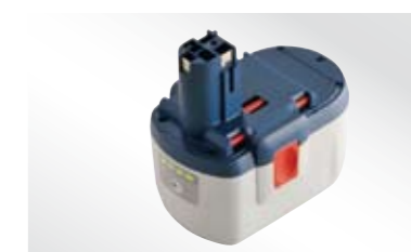
Battery with charge indicator